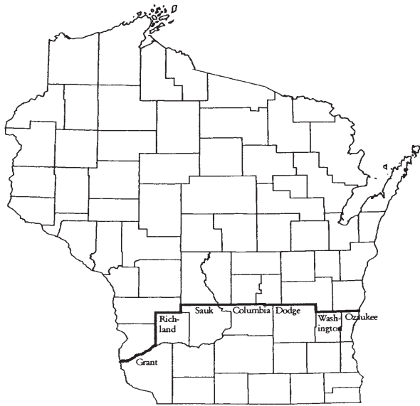
Figure 62.16-2 Alternate 4% g Contour Location

History: CR 00-179: cr. Register December 2001 No. 552, eff. 7-1-02.